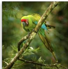
Great Green Macaw